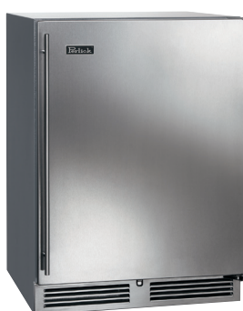
Outdoor Solid Door Model