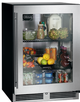
Indoor Glass Door Model