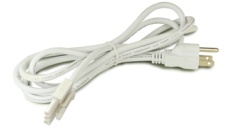
72" Cord & Plug