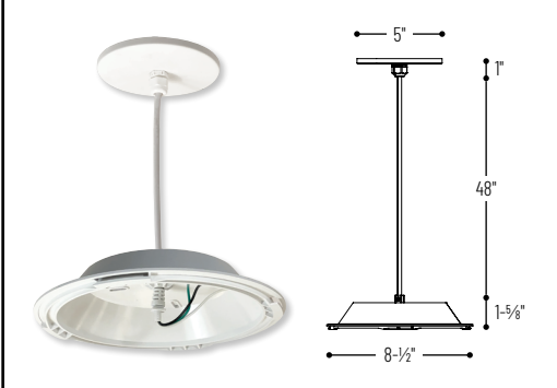
NELOCAC-16PK 4' Pendant Kit for 16" ELO