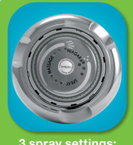
3 spray settings: 9-jet needle, shower and combination