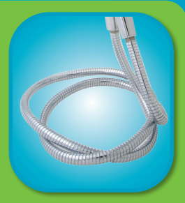
72-inch tangle-free hose