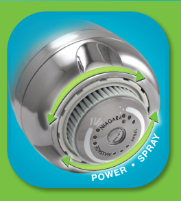
Easy turn dial