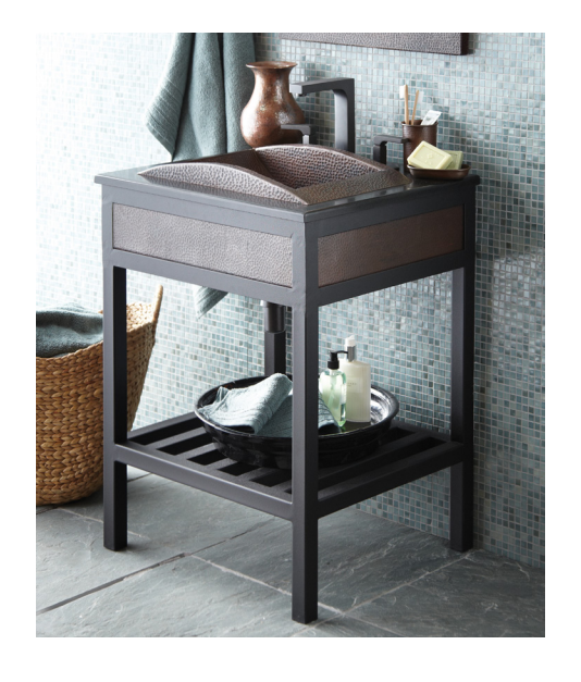
VNR242 Antique VNR245 Brushed Nickel VNR246 Carrara