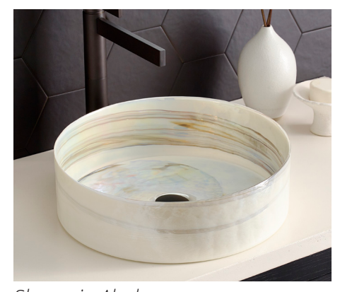
Shown in Abalone

MG1616-AE Abalone MG1616-AS Abyss MG1616-BO Bianco