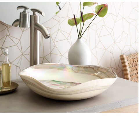
Shown in Abalone

MG1515-AE Abalone MG1515-AS Abyss MG1515-BR Beachcomber MG1515-MA Marina MG1515-SY Seaspray MG1515-SE Shoreline