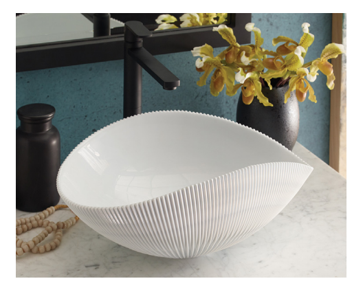
Shown in Bianco

MG1912-AE Abalone MG1912-BO Bianco MG1912-SE Shoreline