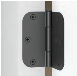
5/8" RADIUS CORNER