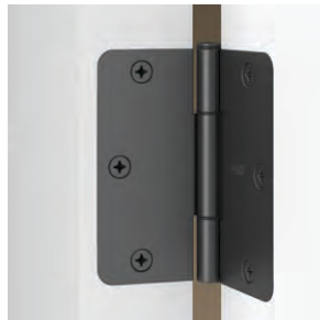
1/4" RADIUS CORNER