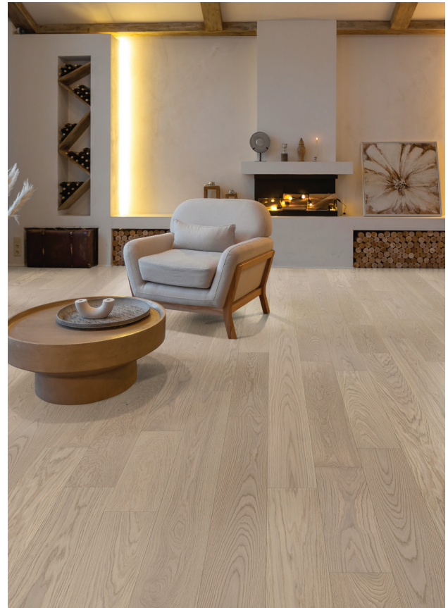
EUROPEAN WHITE OAK CASCADE