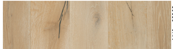
EUROPEAN WHITE OAK OFFSHORE MIST