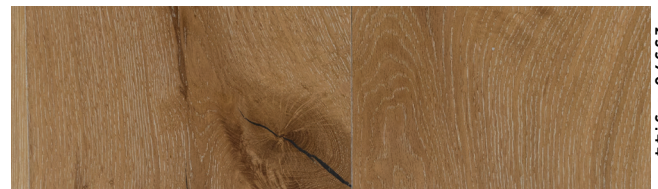
EUROPEAN WHITE OAK CAYMAN *NEW*