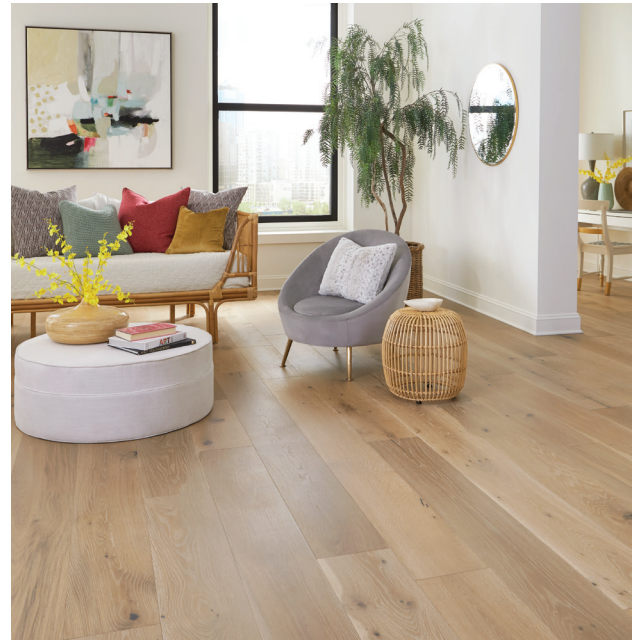
EUROPEAN WHITE OAK COASTAL FOG