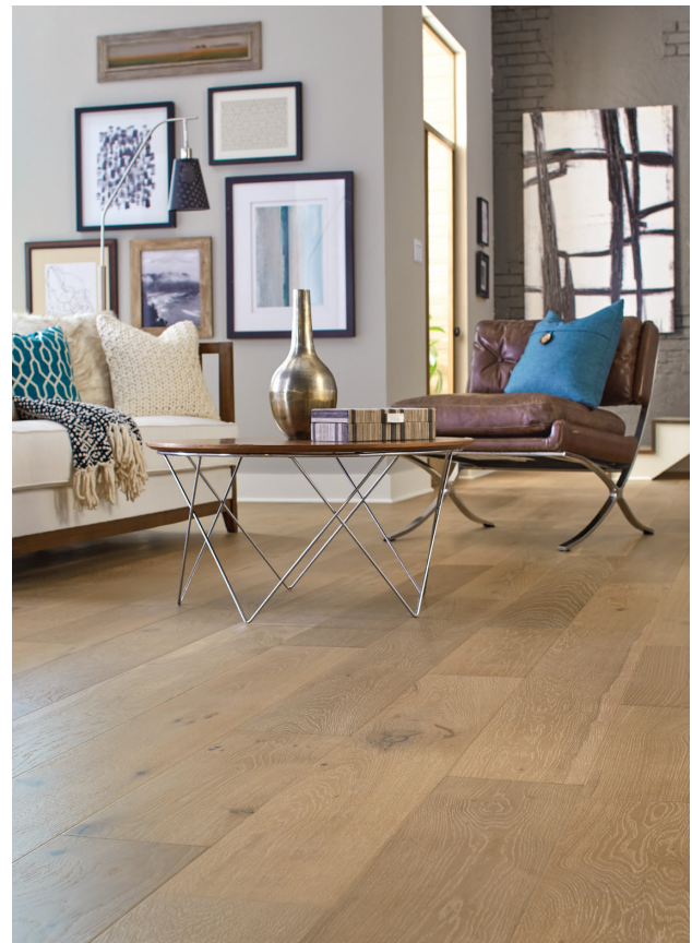
EUROPEAN WHITE OAK OLDTOWN

Width: 7.5-inch Thickness: 9/16-inch Face Treatment: Wirebrushed Veneer Thickness: 3.0 mm Number of Plys: 8 Square Feet/Carton: 27.0 Length: Random up to 7' Weight Per Carton: 52.91 Cartons Per Pallet: 40 Species: European White Oak