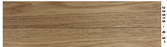
WHITE OAK NATURAL