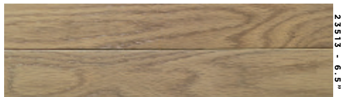
WHITE OAK TOASTED ALMOND