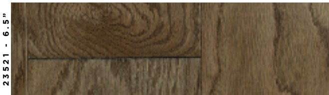
WHITE OAK HAVANA COFFEE