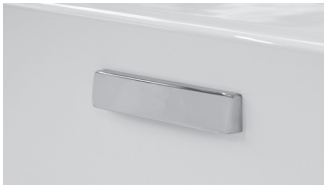
Rectangular overflow included