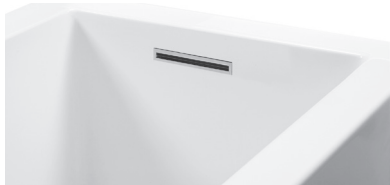
Optional Slim-Line overflow