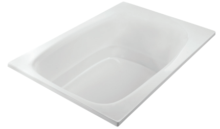
Shown with Whirlpool Package