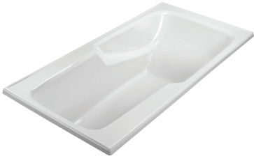
Shown with Whirlpool Package