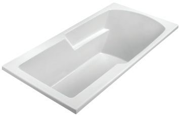
Shown with Whirlpool Package