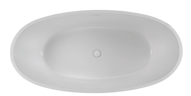
Inside view of tub

Custom sizes also available. Contact MTI for details and pricing.