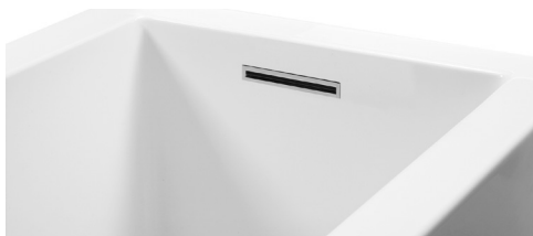
Optional Slim-Line overflow