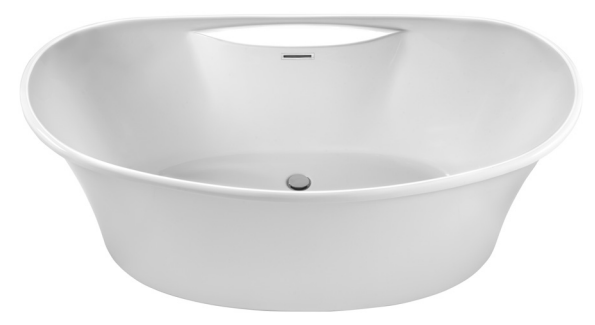
Features an integrated slotted overflow