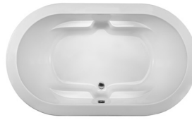
Shown with optional integral armrests