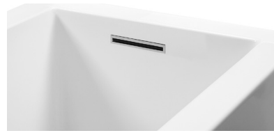
Optional Slim-Line overflow