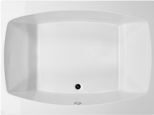
Features a textured bottom