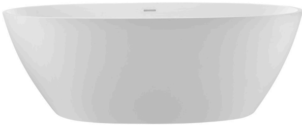
Shown above as soaking bath without pedestal