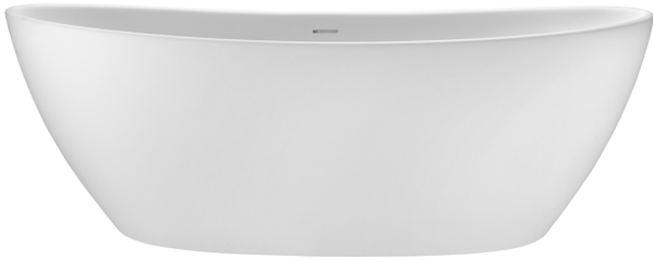
Elise shown above as soaking bath without pedestal