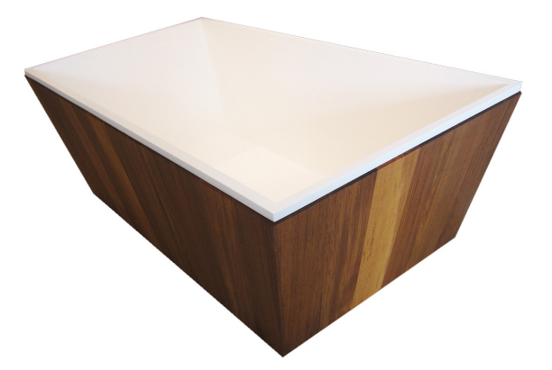
Features an integrated overflow and Teak Wrap.