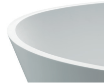
Flat Rim (reduces overall height by 1")