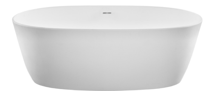
Features an integrated overflow and rolled rim.