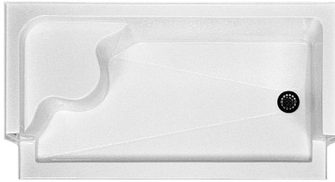
Shown above with right-hand drain.

Material - Acrylic Shipping Weight - 100 lbs / 45 kg Threshold - Low-Profile, Seated Drain Location - End