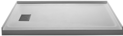
Shown with standard Stainless Steel Hidden Drain Cover.