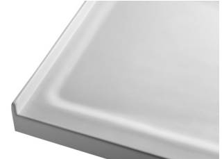
Features softened edges and corners.