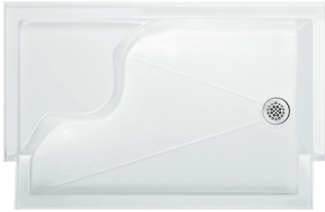
Shown above with right-hand drain.