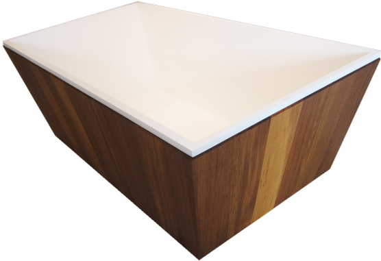
Features an integrated overflow and Teak Wrap.

NOTE: Filling this tub to the maximum may require an above average size or dedicated water heater.