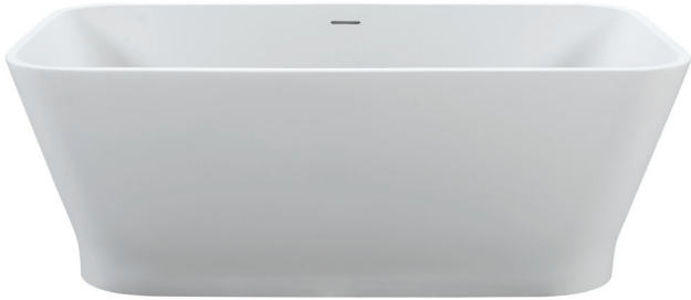
Features an integrated overflow.