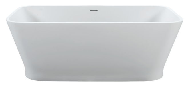
Features an integrated overflow.