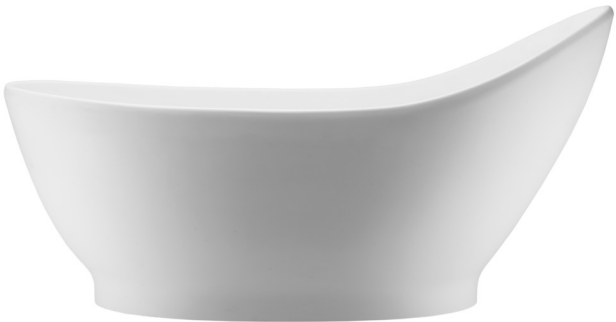
Features an integrated overflow.