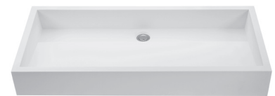
Shown right with drain cover removed.