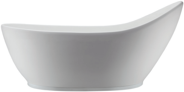
Features an integrated overflow.