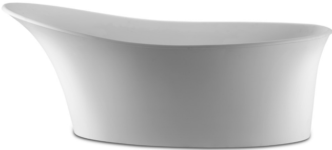
Features an integrated overflow.