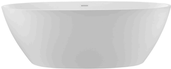
Shown above as soaking bath without pedestal