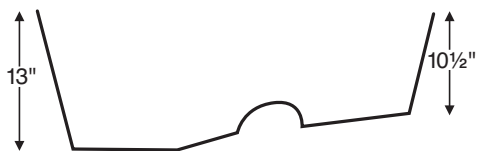
Side view of bottom of spa.

Before ordering or installing, please consider future access to equipment.