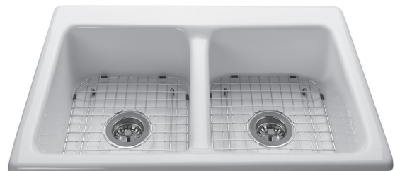
Optional sink grids shown above.