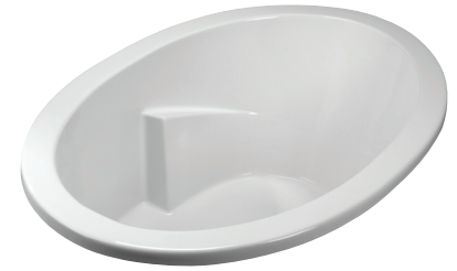
Shown with Whirlpool Package