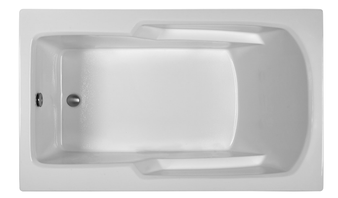
Features integral armrests.