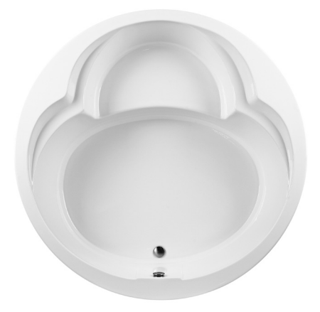
Features an integral seat.