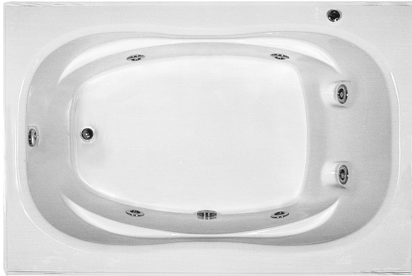
Hartwell features a textured bottom.