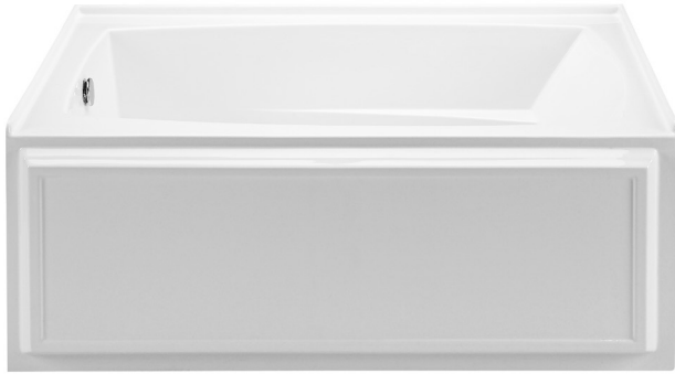
Wyndham 5 features integral skirting, tile flange and armrests.