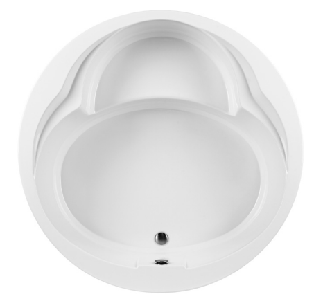
Features an integral seat.