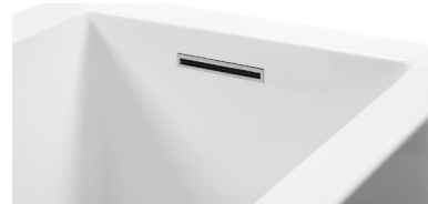
Optional Slim-Line overflow