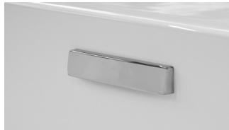
Rectangular overflow included