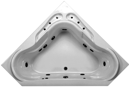
Shown with Standard Whirlpool package and optional Trim Kit.