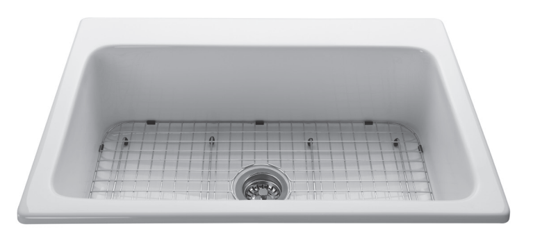
Optional sink grid shown above.

NOTES: Measurements are ±1/2" and are subject to change without notice. Data herein supersedes all previous prior to publication date indicated below.