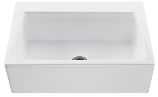
Available with plain or embossed apron at no charge. Please specify when ordering.